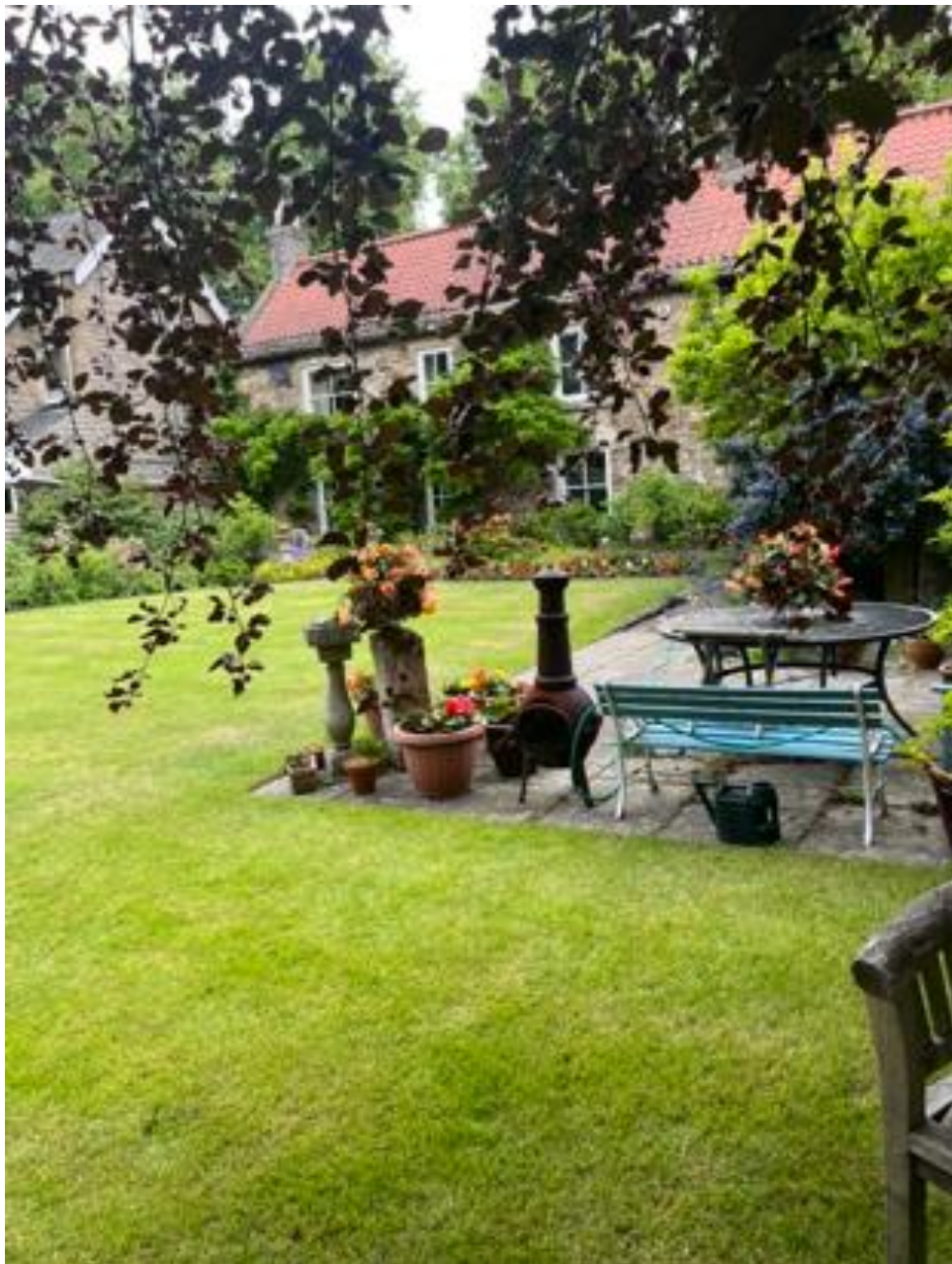
One of the gardens opened to the public in aid of the National Garden Scheme