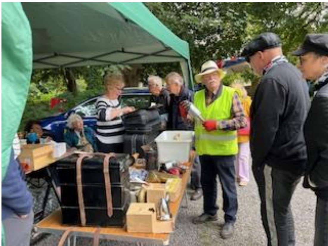
Jim's Emporium at the Classic Car Event