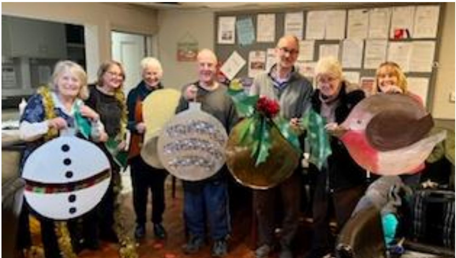
The Art Group with the new and refurbished Christmas decorations for the Village Hall. All helping to create a great atmosphere for the Village Show!