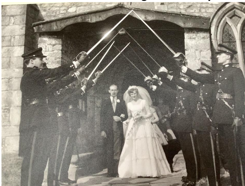
St Romald's Church, Romaldkirk, Teesdale