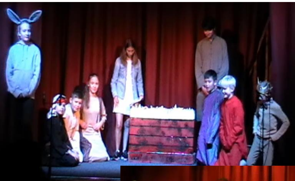
The children's nativity play at the Village Show