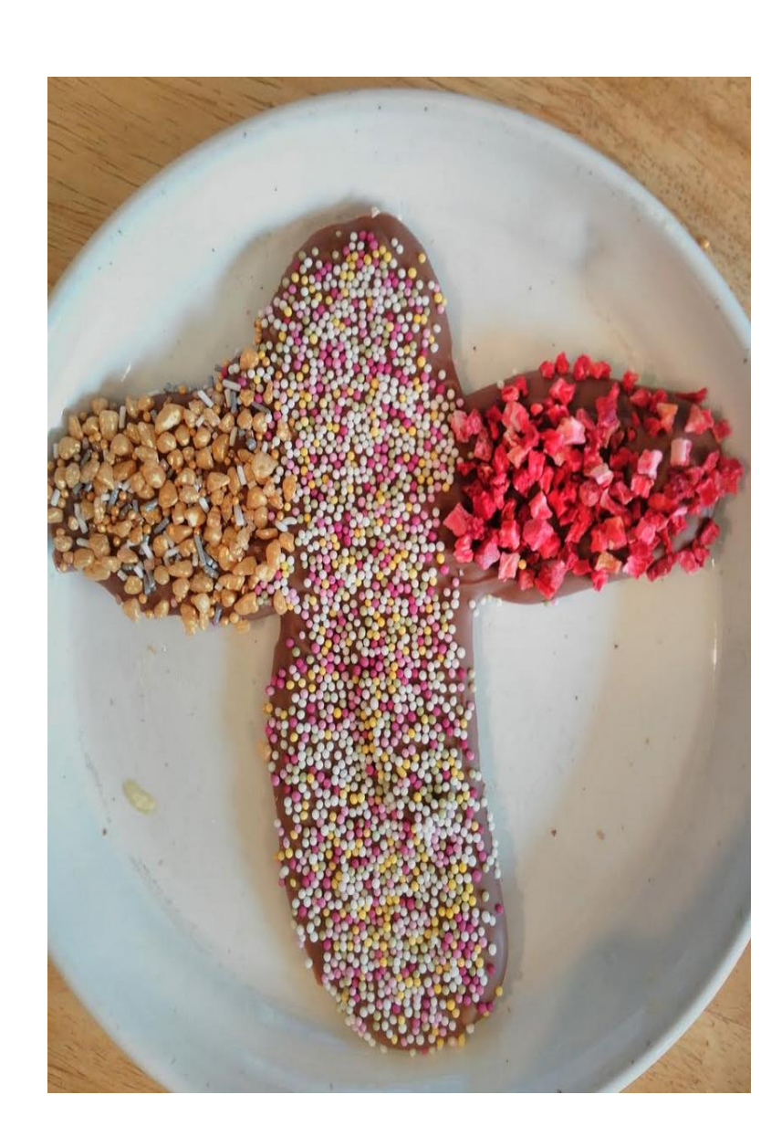
Easter images from Messy Church