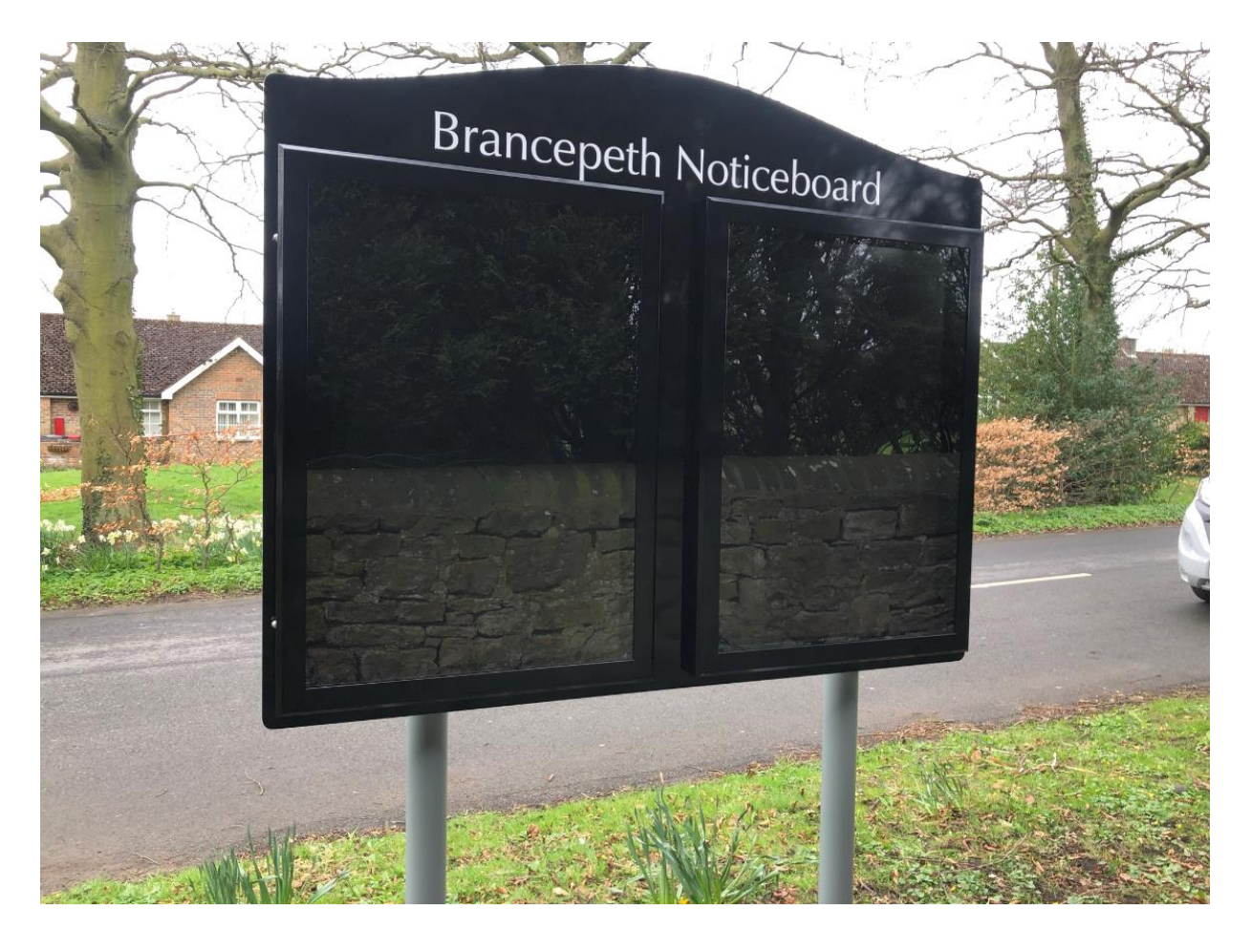
The new Parish Council noticeboard on Wolsingham Road