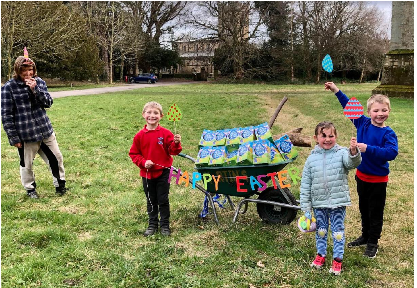
EasterTreats for village children