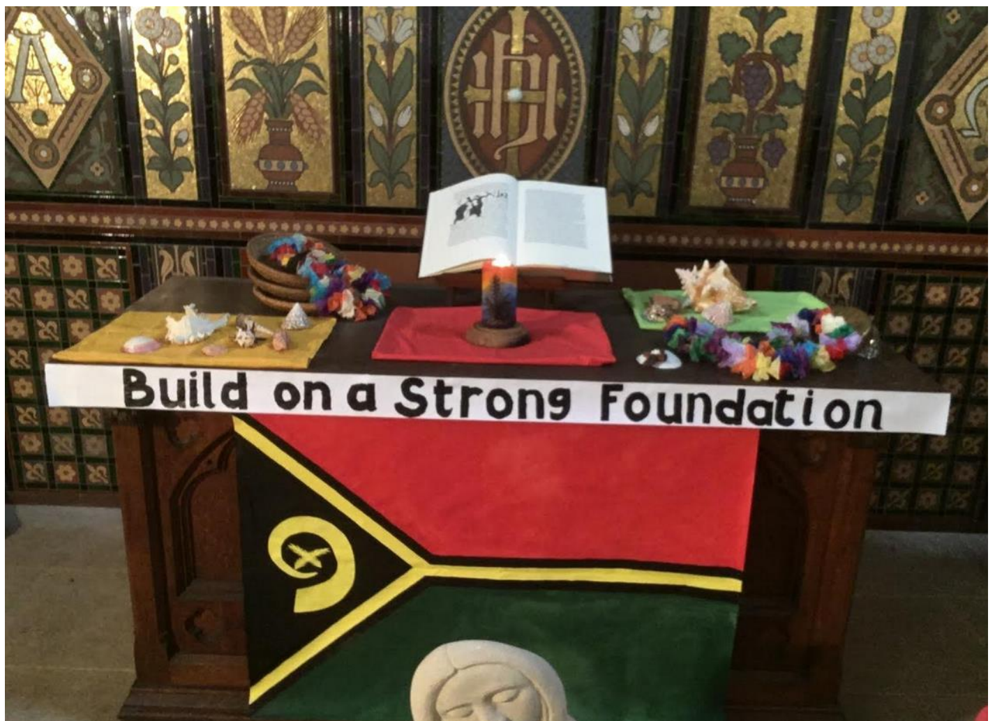
The Castle Chapel altar dressed for the World Day of Prayer