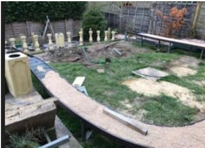
3 Track ballasted and construction of viaduct under way.