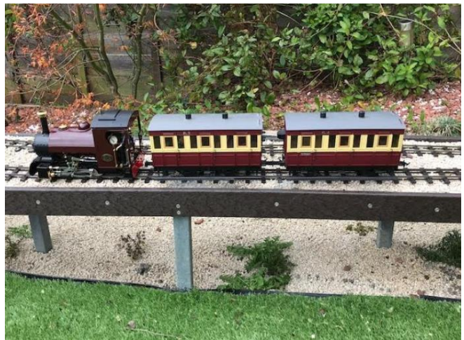
4 Track test for Katie the steam loco