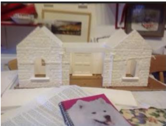
5 Station building underway.