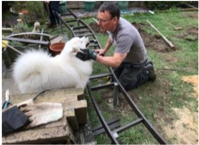
2 The client's representative giving her needs to the SM