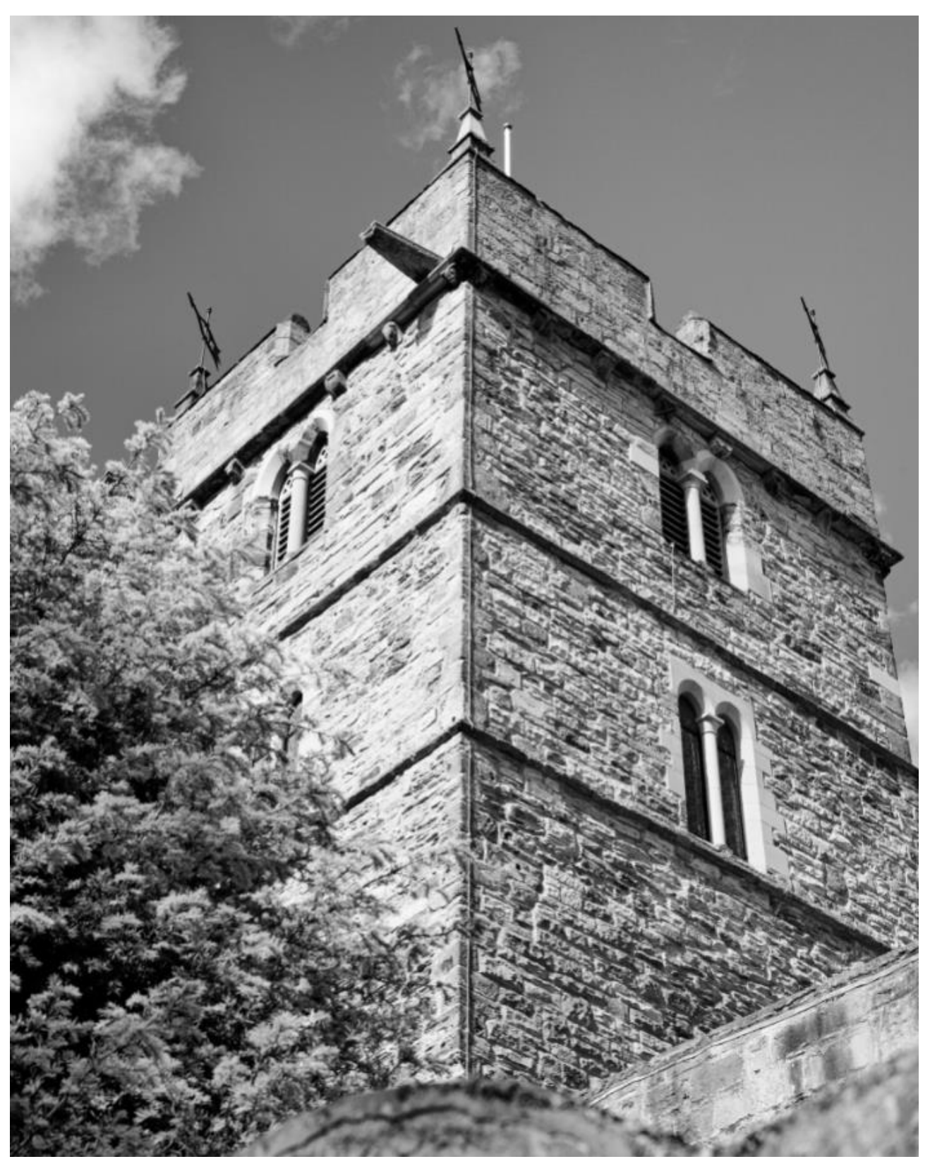
NEWSLETTER: February 2020

Also online at: <a href="https://www.stbrandon.org.uk/newsletter">www.stbrandon.org.uk/newsletter</a>