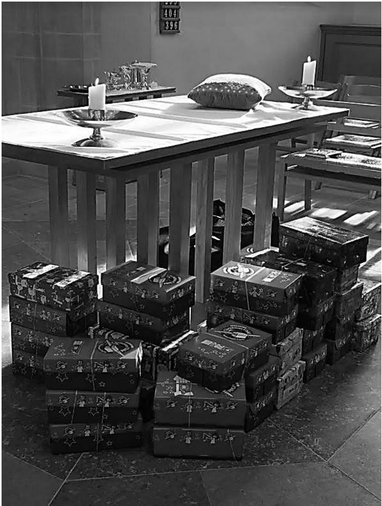
Shoe Boxes collected in church at the service on November 18th for Operation Christmas Child.