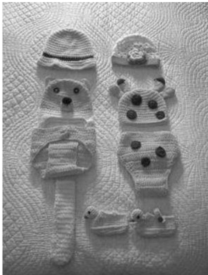
Lihua's children's gifts

We also continue to knit articles for the shoebox appeal and women's refuge.