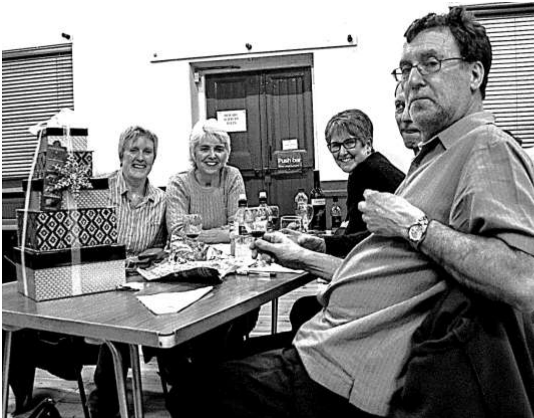
‘The Youngies’ – Winners of the Christmas Quiz